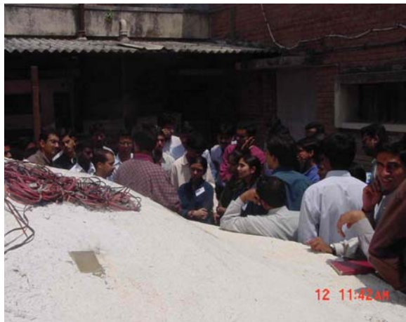
In the Structures laboratory...