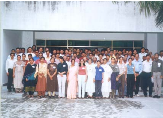
Group Photo of Workshop Participants