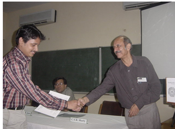
Workshop Certificates Distribution...