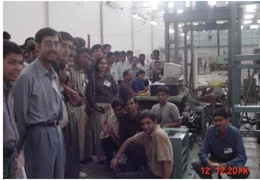
Workshop Participants in the Structures laboratory